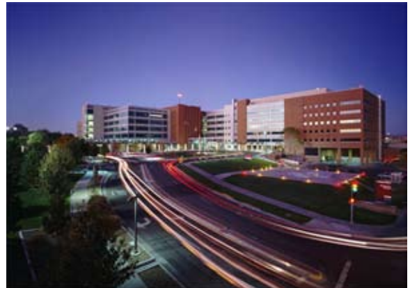
Presbyterian Health Services East Expansion - Albuquerque, NM

Date: January, 2012 Time: 7:00 to 9:00 p.m. Place: Dekker/Perich/Sabatini 7601 Jefferson NE, Suite 100 Albuquerque, NM 87109