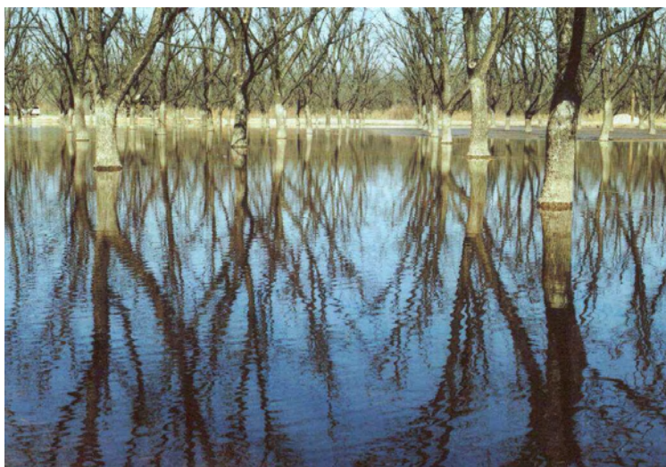
Pecan Orchard in New Mexico by Celestyn Brozek

birds in New Mexico and occasionally out of the state.