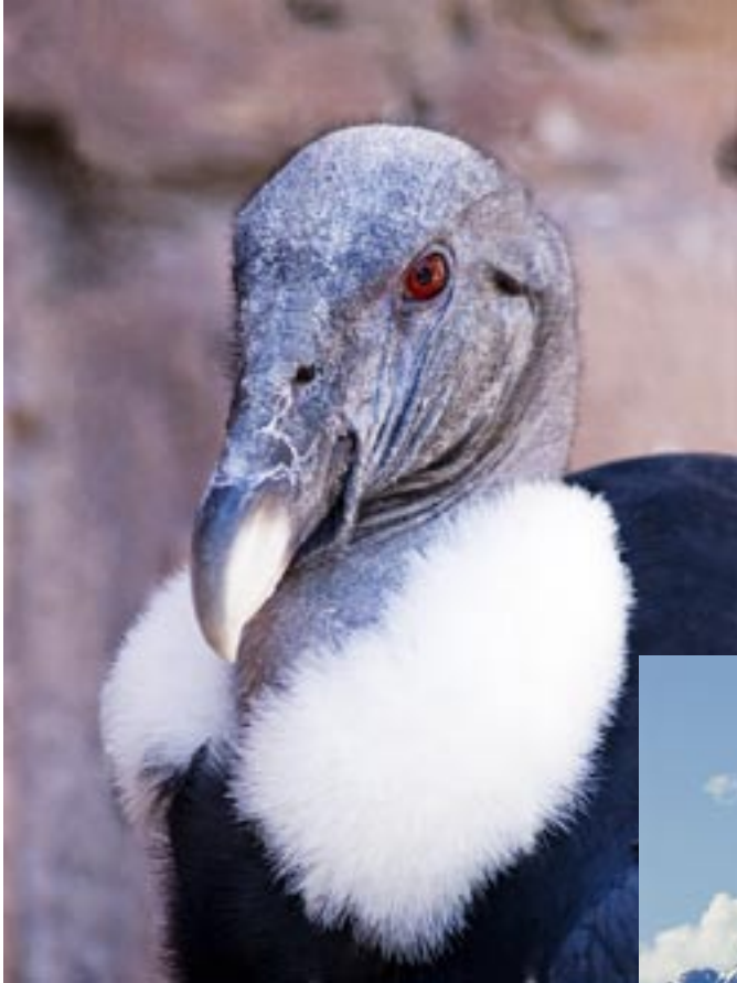
New Fur Collar by Jack Houser