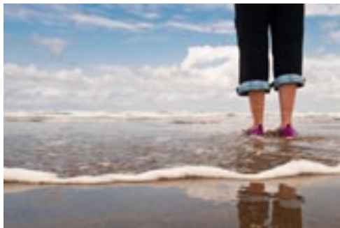
Last Day at the Beach by Tye Hardison