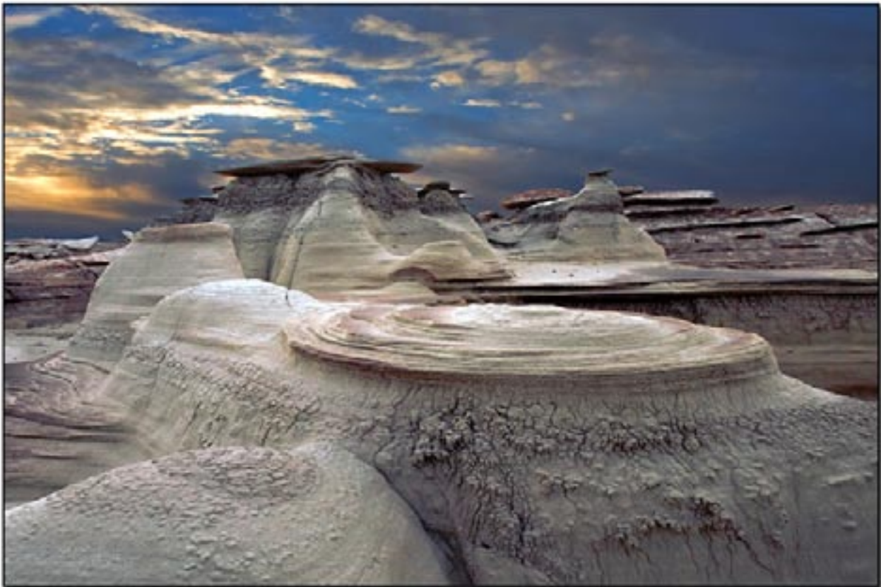
The Planet Bisti