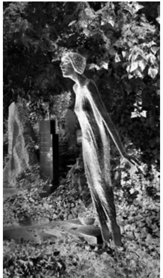
A Leap O Faith