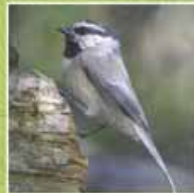
Mountain Chickadee Parus gambeli