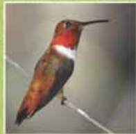
Rufous Hummingbird Selasphorus rufus