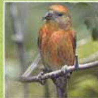
Red Crossbill Loxia curvirostris