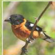
Black-headed Grosbeak Pheucticus melanocephalus