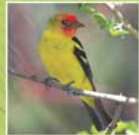
Western Tanager Piranga ludoviciana