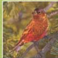
Brown-capped Rosy Finch Leucosticte