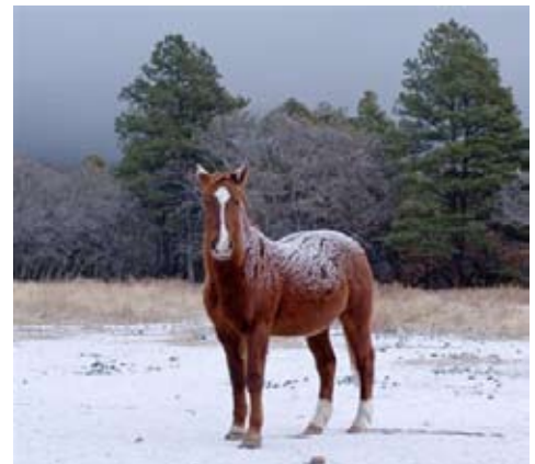
B-Open Horse in Snow Photographer? not listed in ELCC gallery